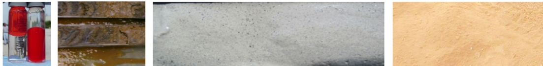
NAPL pools Mobile NAPL Ganglia Droplets Adsorbed/dissolved Trace

Our solutions are more focused. We foresee synergies between characterization and remediation, optimize placement and construction of borings and wells such that no over drilling is needed. By minimizing the effort to achieve the project goals, we save our clients money and deliver more sustainable solutions.